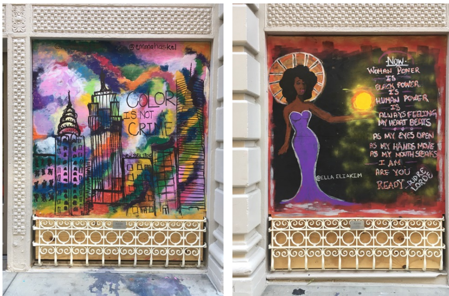
Black artists, including many female artists, painted the boarded-up windows in Soho in June 2020 during the BLM demonstrations in NYC.

The challenges of the coronavirus for educational institutions are unprecedented, including economic survival. Faculty have invented approaches to staging virtual productions that have led to discoveries in collaboration and conceptualization. They have devised ways to capture the attention of students whose lives have changed overnight, while suffering the same upheaval and uncertainty themselves. And they have actively embraced a renewed focus on teaching methodologies, including, but not limited to, generative methods of engagement for remote learning for both artistic and academic courses. Many faculty have gone from crisis to challenge to opportunity in a very brief period. Fall 2020 will present more challenges and will definitely not be a return to normal. That theatre and performance studies students participate in the full array of opportunities that colleges and universities offer is more urgent. Double