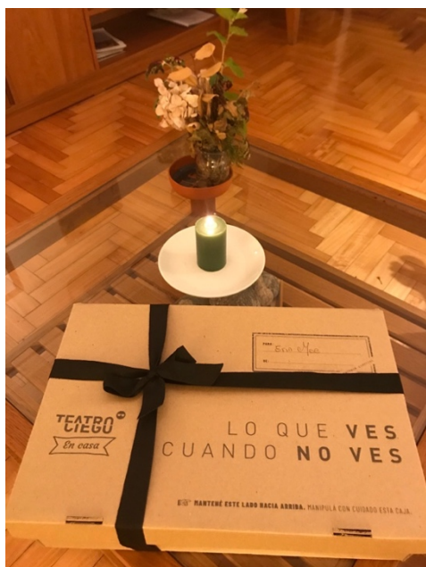
The dinner delivered to my apartment for Teatro Ciego's ongoing "Take Away" theatre production of Teatro En Su Casa, 9 May 2020. (Photos by Erin B. Mee)